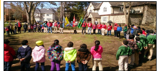
66 Scouts + 18 Leaders of both Groups at Morning Flag-break

24-26 at the premises and grounds of the Darbe Mehr in Toronto. Overall attendance comprised of 66 scouts (Beavers, Cubs and Venturers), 18 Scouters (i.e., leaders) and 6 Group Committee Members who assisted in various ways. The scouts were divided into 8 Patrols, with 2 Scouters assigned to each Patrol. Each Patrol took part in 8 safe, fun-filled, skill building activities including Kim's Game, Estimation, Mine Field, Fire-lighting, First Aid, Woggle & Bracelet making and the most thrilling of all - being harnessed and Crossing the Creek! All 8 patrols were