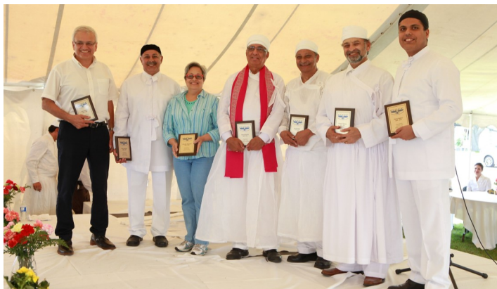
The Past and the Present - All seven OZCF President's from 2002 till date.