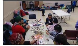
Cubs making Bracelets.

100 Toronto Scouts Group hosted its sister Group, 100 Oakville at the Second Annual Link