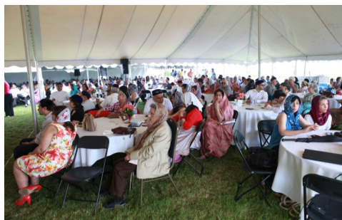
A small section of the crowd of over 700 guests