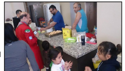
Preparing appetizing meals