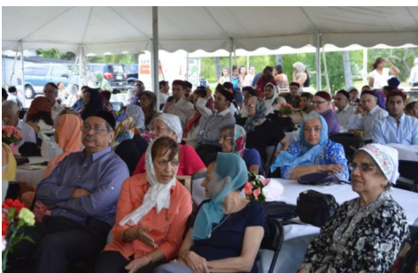
Senior Zoroastrians at the event